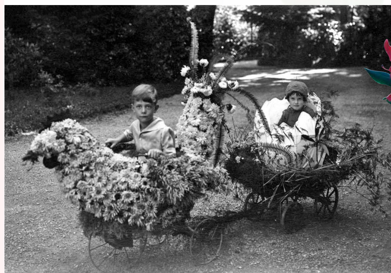
Right and below: Bicycles, automobiles, and carriages adorned with lake flowers during the annual competitions.